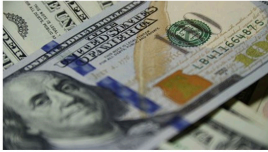
Federal rules committee recommends no immediate action for third-party funding disclosure rulemaking at recent meeting