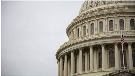
TPLF disclosure proposals are introduced in Kansas, Mississippi, and Montana state legislatures