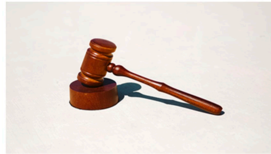
Illinois enacts the "Consumer Legal Funding Act" -- new law regulates various aspects of third-party litigation funding practices