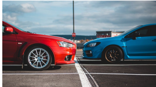
The Highway Accident Fairness Act of 2023 (H.R. 2936) is introduced into Congress – bill prohibits staged accidents with commercial vehicles and includes TPLF disclosure provisions