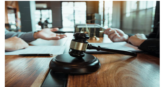
Montana enacts the “Litigation Financing Transparency and Consumer Protection Act” – new law regulates TPLF practices and includes disclosure and discovery provisions