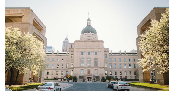
Indiana enacts statutory provision regarding Third-Party Litigation Funding (TPLF) disclosure