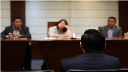
Florida (and other states) take aim at regulating Third-Party Litigation Funding